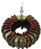
Inductor copper foil cracked due to high temperature

Magnetic saturation current is called I_{sat} , and the temperature rise current is called I_{rms} . When the transformer and the inductor pass a large current in the actual circuit operation, the magnetic field of the magnetic core will produce magnetic saturation, which will cause the inductance characteristic to decline. Therefore, the R&D engineer will set the current value of the inductance reduction allowable range.