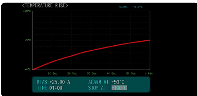
Irms (Rated current curve)

Using a DC Bias current source to apply a 10A bias current to the inductor, the inductance decreased from 2.06983uH to 1.02845uH.